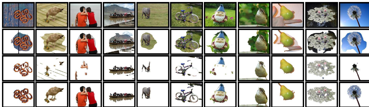
Figure 2. First row: The original images. Second row: the envelope of the object. Third row: the skeleton of the object. Last row: the final results. It can be seen that our results are robust and edge well-defined, even in some tough cases.

we uniformly binarize their output saliency maps with the method proposed in [6]. The approaches that are optimized either adopted complicated but undesirable binarization methods or outputted only salient points. It can be seen from Figure 4 that our method remarkably outperforms all the other six methods, with a precision of 0.88 and a recall of 0.89 .