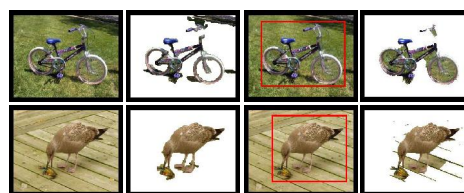
Figure 3. Visual comparison with GrabCut. The second and fourth columns are our and Grabcut's results, respectively.